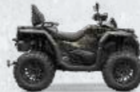
CFORCE 1000 TOURING