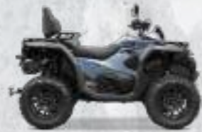
CFORCE 850 TOURING