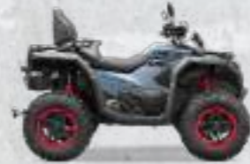
CFORCE 850 TOURING - premium