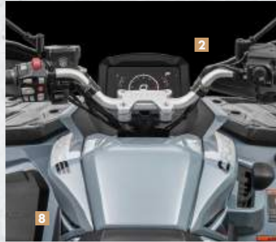
CFORCE 850 TOURING & 1000 TOURING