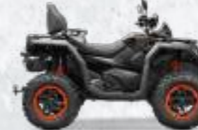
CFORCE 1000 TOURING - premium